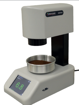
The QuikCheck Moisture Analyzer is a benchtop NIR instrument ideally suited for analyzing product samples at-line.

Roasted coffee moisture is usually less than 5%. The moisture content will impact the quality of the roasted coffee and will reflect on the drinking experience of coffee consumers.